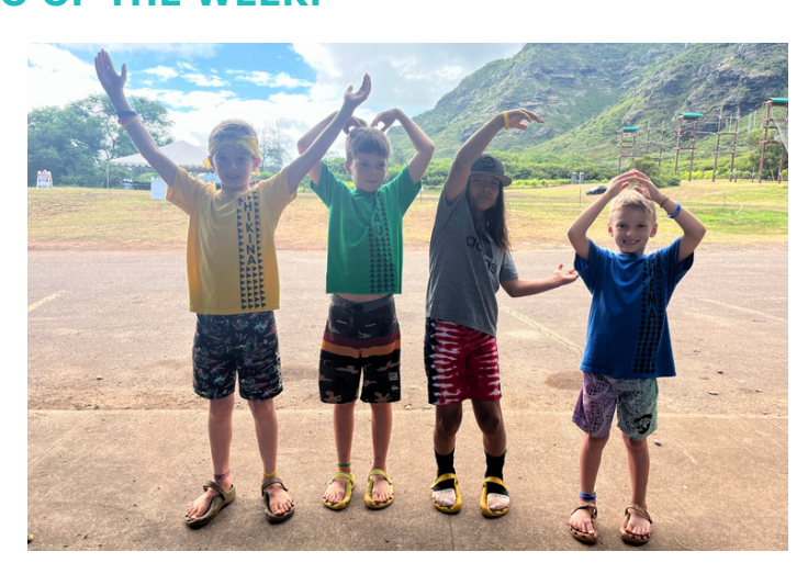
"You ain't rocking if you ain't Croc-ing at the YMCA"